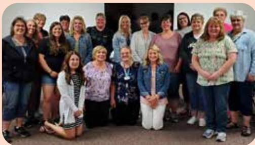
2021-22 Childcaring Director Cohort reunion session. The session included directors from past years.

"She was a wonderful presenter. She has encouraged me to look at things differently."