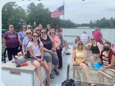
Enjoying Staff Time Together!

Often when you think you're at the end of something, you're at the beginning of something else." - Fred Rogers