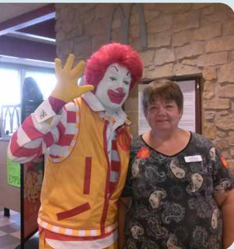
Representing Childcarer at McDonald's United Way Day!