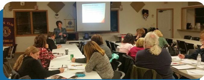
(Pictured: Child Care Providers Attended the free MyWICChildCare: Informational Session at the Pittsville Lion's Club on December 8)