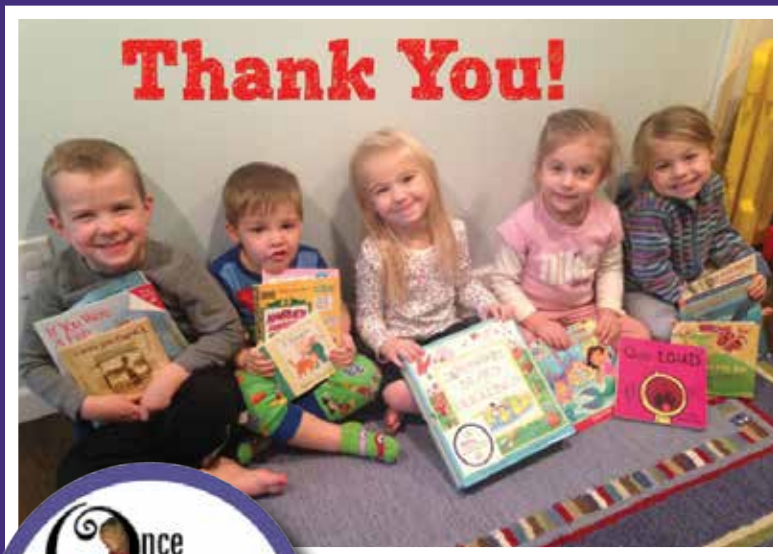
A "thank you" from a child care provider who received Once Upon a Book Drive books in 2015.