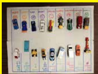
Feelings Parking Lot

http://therapeuticinterventionsk-12.blogspot.com/2013/04/feelings-parking-lot.html