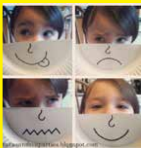
Paper Plate Feelings

Start with your GOAL, then find your activity and adapt if necessary! WMELS goal(s) is (are): A.EL.1 Expresses a wide range of emotions and/ or A.EL.2 Understands and responds to other's emotions.