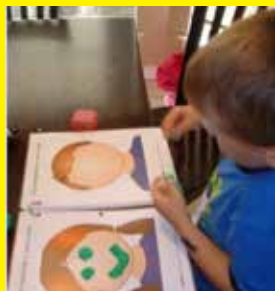
Playdough Mat Booklet